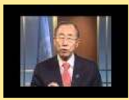
Please Click Here!