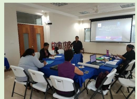
Figure 2 Media from the Belize District who participated in the S&D training

The training were well received, so much so that one of the media representative recently hosted a member of the key affected populations and was able to utilize the skills aquired at the training.