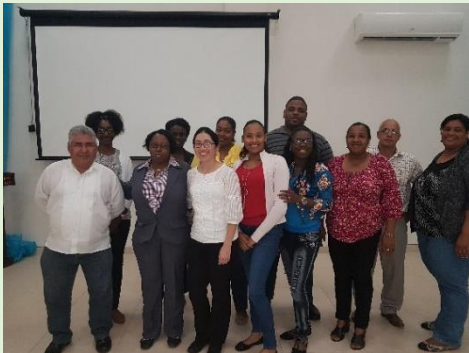
Figure 1 Health Care Administrators and Educators from the Belize District who participated in the S&D training

The Global Fund Project in collaboration with the National AIDS Commission of Belize, hosted a series of trainings under the theme: “Creating an Enabling Environment for key populations affected by HIV/TB” with key sectors in three Districts in Belize. The training was adapted from the PANCAP Anti-Stigma Toolkits for the Caribbean, which seeks to sensitizing and training key sectors in the response to HIV with the aim of creating an enabling environment for key populations affected by HIV in Belize. The training was implemented with the following key sectors: media, health care administrators/educators, health care providers and judiciary.