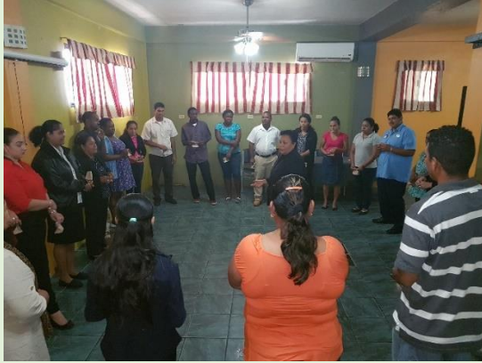
Figure 3 Cayo District Administrators and Educators Partaking in a Simulation Activity

Four other trainings were held with health care administrators and Providers from the Belize and Cayo districts. A total of 68 combined representatives from our National Health Insurance Clinics, Belize Family Life Association, The Health Education and Community Participation Bureau, HIV Voluntary Counselling and Testing Clinic, Belmopan Hospital and the San Ignacio Hospital were present at these trainings. The invitees benefitted from similar presentations that were presented in the first training however emphasis was placed on the administrators' and providers' role in providing their organizations with the necessary education for a more inclusive service provision for key affected population.